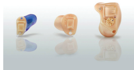
The Intuir family of products is available in all custom styles.